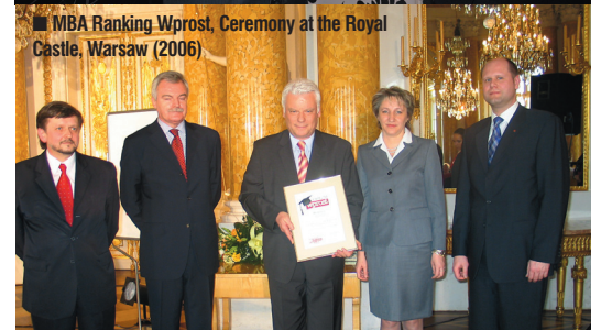
■ MBA Ranking Wprost, Ceremony at the Royal Castle, Warsaw (2006)