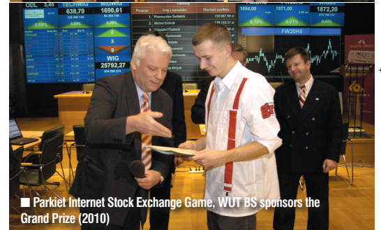
■ Parkiet Internet Stock Exchange Game, WUT BS sponsors the Grand Prize (2010)