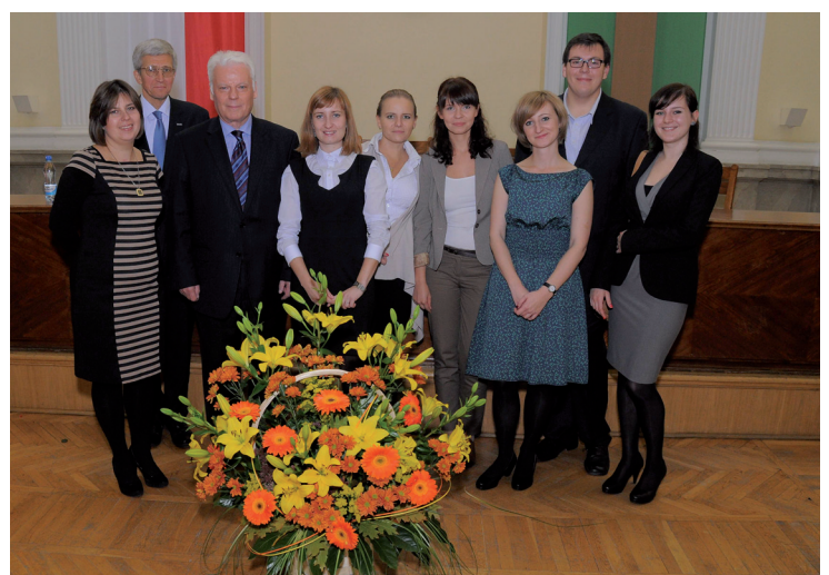
■ WUT BS Team, Inauguration Ceremony (2011)